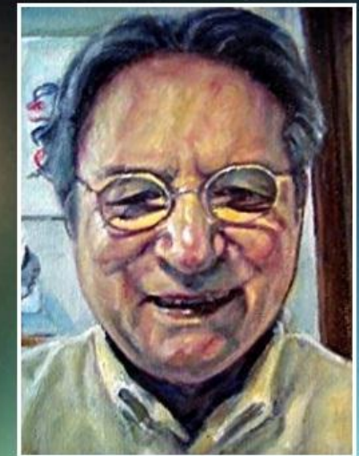
Alfred LAMBREMONT WEBRE