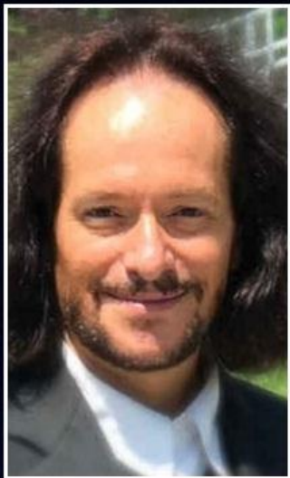
Organized by Ananda BOSMAN